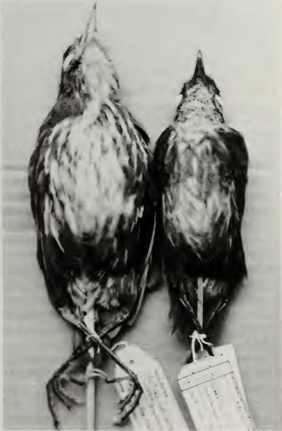
FIG. 1. Continued.

to Hypsibemon Cabanis on the basis of its tarsal scutellation, 12 rectrices, and ratios of wing, tail, and tarsus lengths (Table 1, cf Lowery and O'Neill 1969). However, it is smaller than any other species of this subgenus, and the streaking is much less broad and conspicuous on the underparts. Moreover, one of the supposed diagnostic characters of Hypsibemon , pale shaft-streaks on the dorsum, is quite lacking not only in G. kaestneri , but also in all individuals of G. bangsi and most of the Chestnut-crowned Antpitta ( G. ruficapilla ) (in a few there are faint suggestions of shaft-streaks) I have seen. On the other hand, the narrow sooty fringes and faint dark barring of the dorsal feathers of kaestneri are shared by bangsi ; the barring is also faintly suggested in ruficapilla , as well as in several species of the subgenus Grallaria ( alleni , guatemalensis , squamigera ), but not in any of the species of Oropezus I have examined ( flavotincta , hypoleuca , rufula , rufocinerea , or quitensis ). This, plus the close approach of the measurements of Grallaria and Hypsibemon , suggests that these subgenera are closely related and should be adjacent to one another in the sequence, not separated by Thamnocharis as in Lowery and O'Neill (1969).